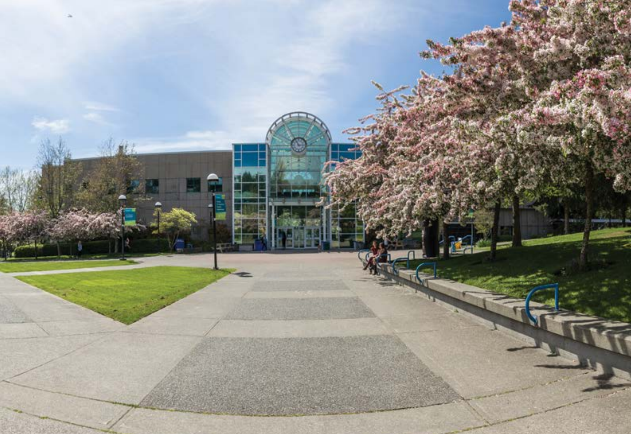
CAMOSUN COLLEGE INTERURBAN CAMPUS